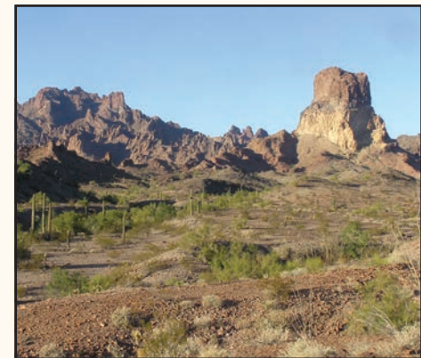
Top, Agave in bloom. Middle, Desert Tortoise. Bottom, Thumb Butte.

Please see the Public Use and Hunting Regulations leaflet for additional information about visitor activities and refuge regulations.